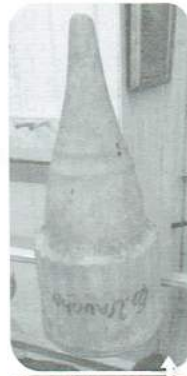
E. Vaughn cobalt blue