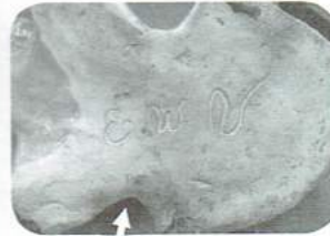
Initials Inscribed: E.W.V.